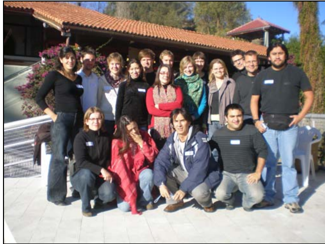
Participants of the PhD winter school

A two-day PhD winter school preceded the conference. Its objective was to bring together all young researchers for a first time, to give them the chance for social interaction, present and discuss their PhD projects, as well as to learn about the interdisciplinary approach of the initiative. A feedback from the participating PhD after the winter school showed its substantial benefits in several aspects: sense of belonging to the network of researchers in the initiative, knowledge on the scope and concept, the opportunity to develop experience in intercultural skills, learning about other disciplines and the chance to receive positive feedback from the other studies being carried out in the project context. A critical comment related to the fact that the interdisciplinary nature of the project might interfere with or obscure disciplinary work.